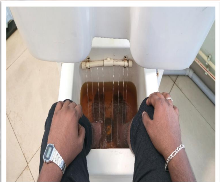
Pāshoya (Foot bath)