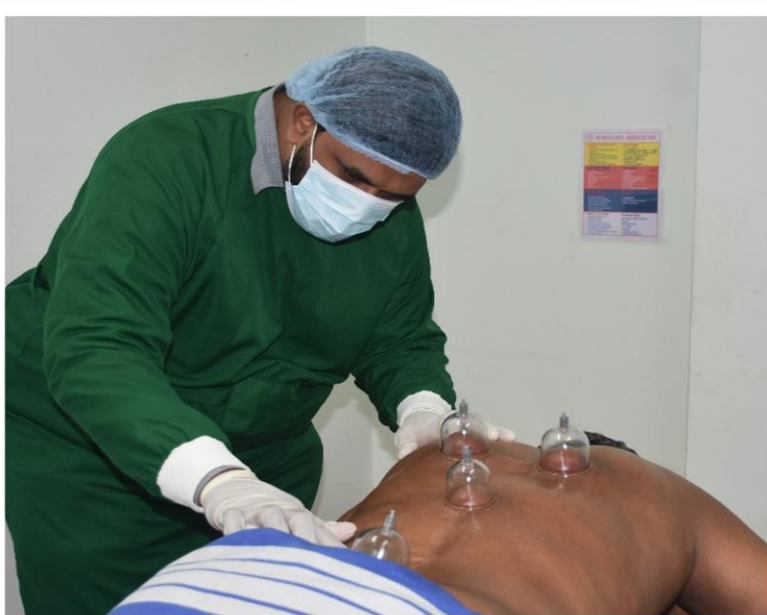
Hijāma bilā Shart (Cupping without scarification)