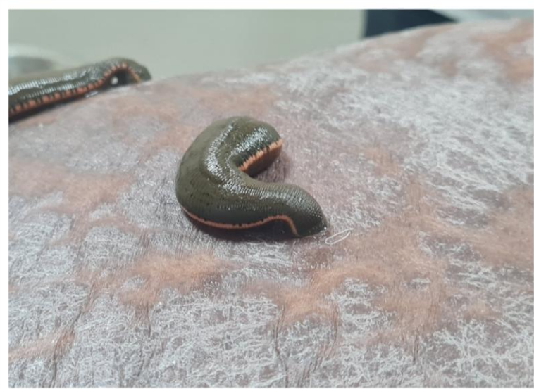
Ta'liq al-'Alaq (Leech therapy)