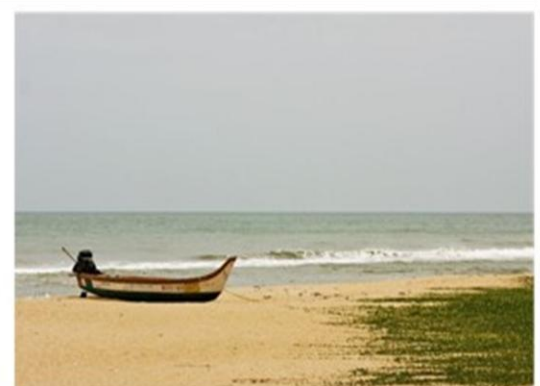
VGP Golden Beach