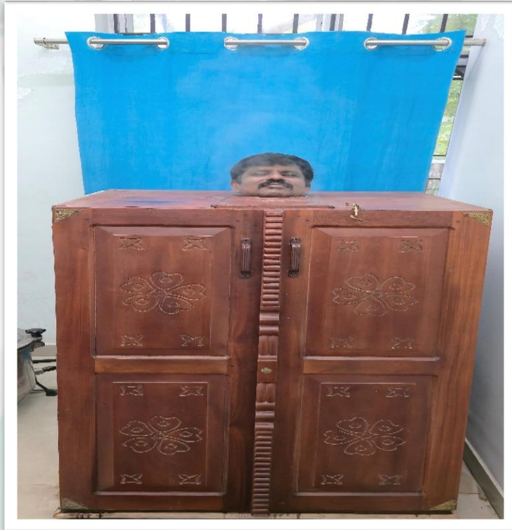
Full body steam