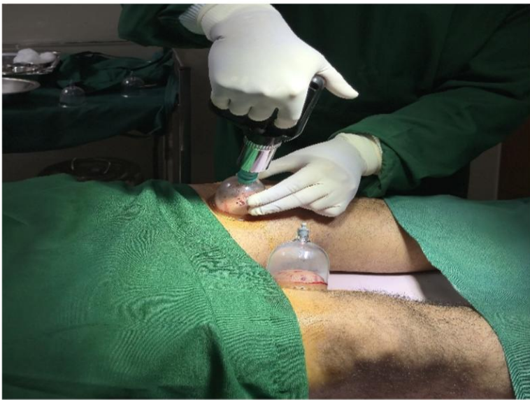
Hijāma bi'l Shart (Cupping with scarification)