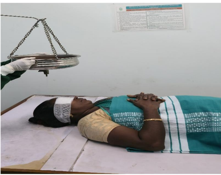
Natūl (Irrigation) therapy