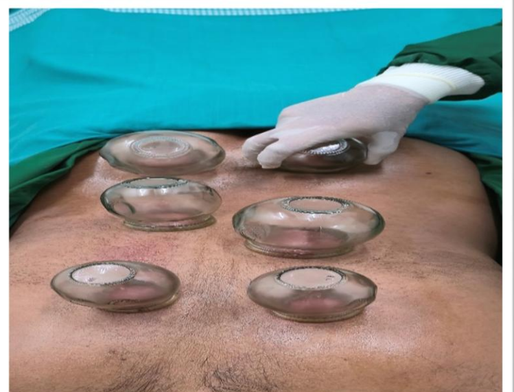
Hijāma Muzliqa (Massage cupping)